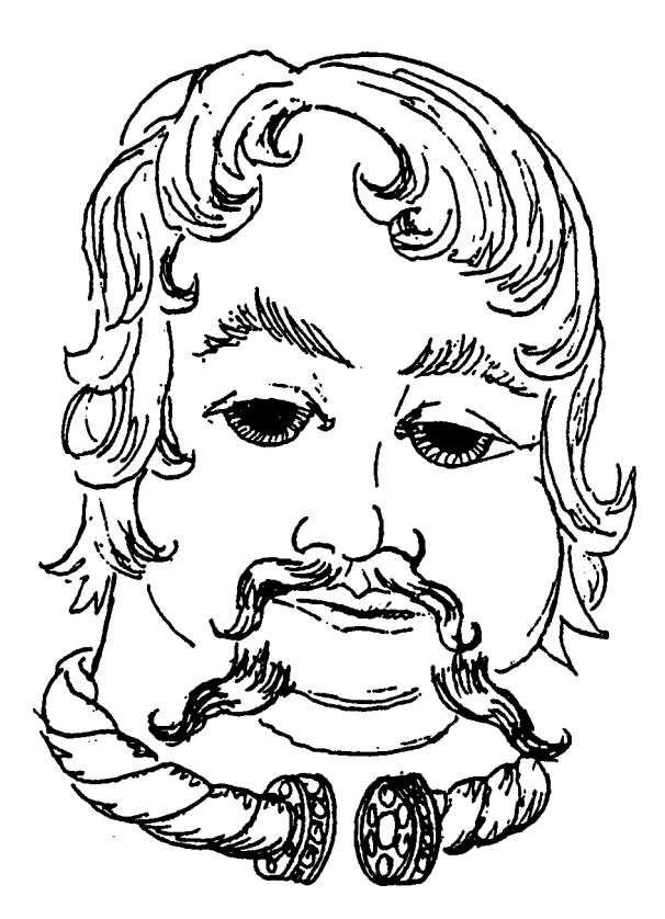
One SDNA artist's conception of Bracacia

Various branches of the Reform may add more holidays and celebrations in honour of different gods and goddesses to the above list. Those for the Schismatic Druids of North America will be found in the SDNA Calendars.