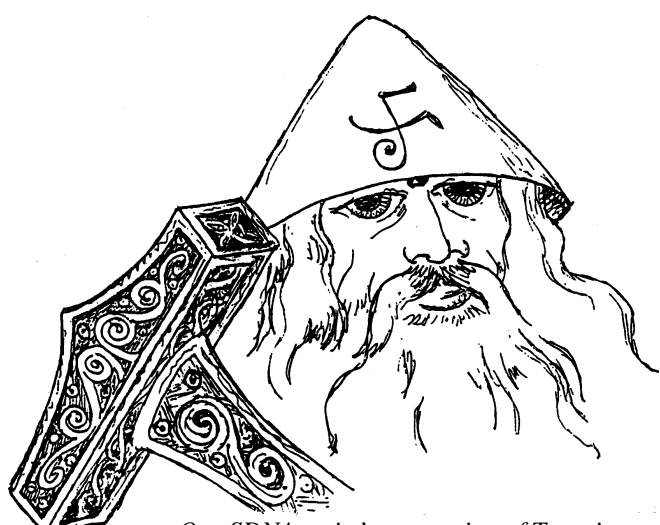
One SDNA artist's conception of Taranis

Dec 29th, 1963 July 30, 1988 Nov 1, 1966 Jan 1, 1964 June 2, 1977