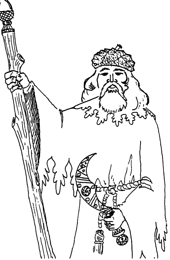
One SDNA artist's conception of Dalon ap Landu.

Protogroves will be starting up soon in many parts of the country. See the address in the Box below for the Druids closest to you.